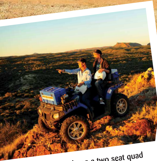
Ride with the guide on a two seat quad