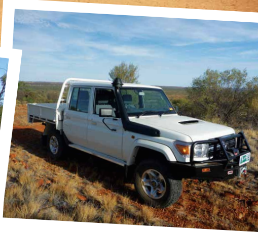
Four Wheel Drive